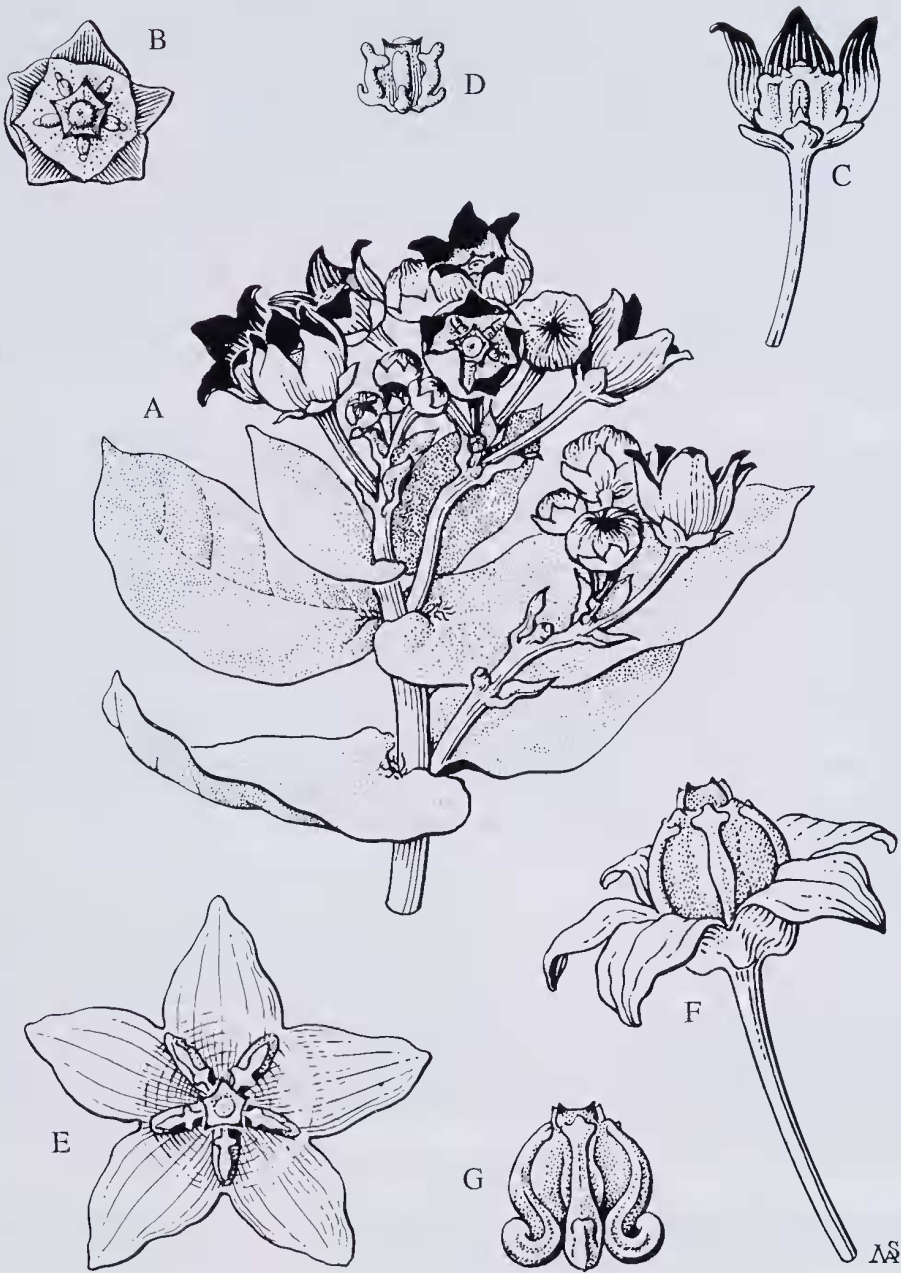
Figure 1. A-D- Calotropis procera , E-F-C. gigantea . A-habit of flowering branch. B & E-apical view of flower. C-side view of flower with part of corolla removed showing staminal column. D & G-side view of staminal corona and staminal column. F-side view of flower. (All actual size).